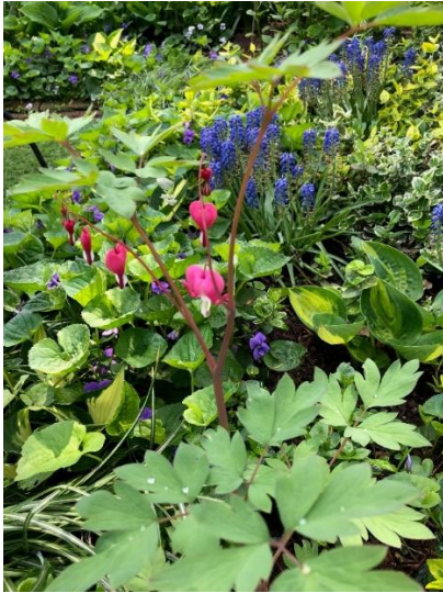
Bleeding heart and Grape Hyacinth